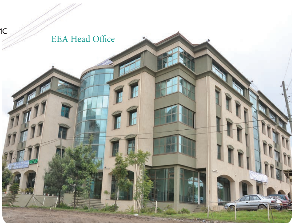
EEA Head Office

Email: eea@ethionet.et Website: www.eaecon.org